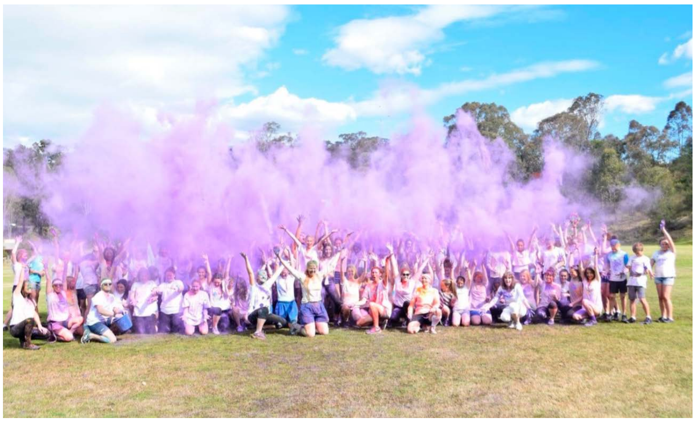
Wear it Purple Day Colour Run at Colo High School (Annual WIPD "Purple Powder Photo")

Students will be required to bring a change of clothes for the event. Obviously the powder shows up best on white, so we recommend students wear at least a white t-shirt. The powder is food-based and washes out easily.